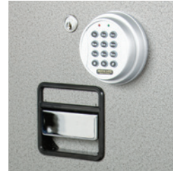
Secure digital locking mechanism.