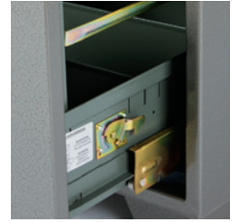
Independently fire resistant drawers.