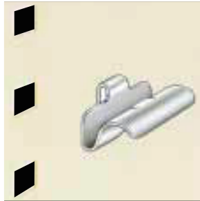
Light Duty Shelf Clip