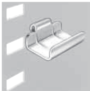
Medium Duty Shelf Clip