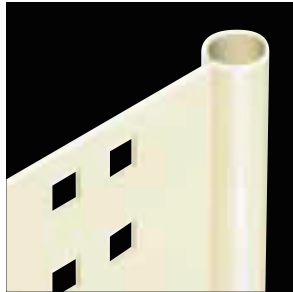
Light Duty (RUT) Upright